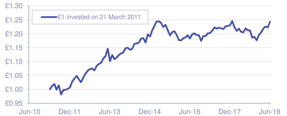
Growth of an investment of £1